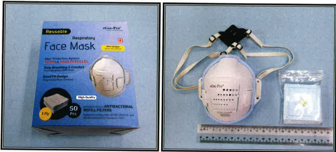
Photograph 1 eGee-Pro Mask with antibacterial refill filter as received